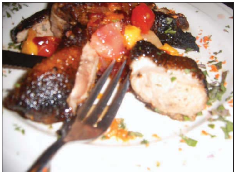
High-quality skin ensures a beautiful presentation

Your holiday guests are going to love the duck you serve them, and they're certainly going to want more each and every year. When shopping for duck products, it's important to keep future availability in mind. Some suppliers will only make frozen duck meats available for purchase. If you want fresh meats during the season, you will have to seek out a farm that makes both fresh and frozen duck meats available to you year-round. Only these suppliers will be able to satisfy all of your dinner guests.