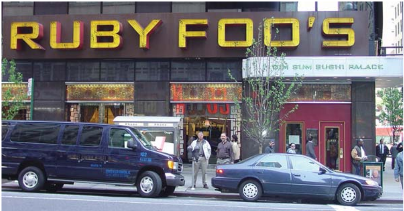
Ruby Foo's is a popular Pan-Asian concept restaurant located right in the heart of New York City's Times Square